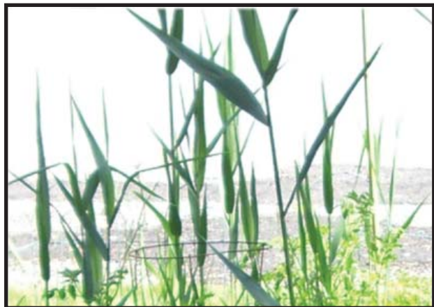
Corn in our New Jersey garden, spring 2007

We will do everything we can to sustain a strong quality of life for our employees including pay raises that go beyond the rising cost of living. These efforts include encouraging our employee organic gardens.