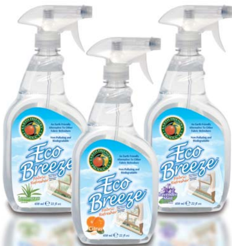
ECO BREEZE™ Fabric Fresheners

You can safely bury your nose in that. ■